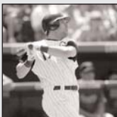
Todd Helton .337 AVG .433 OBP .607 SLG

Todd Helton, Lou Gehrig, Albert Pujols, Babe Ruth and Ted Williams are the only five players in major league history to possess a .330 batting average, .400 on-base percentage and .600 slugging percentage in their careers (min. 3,000 PA). Pujols reached 3,000 career plate appearances in 2005.