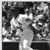
Albert Pujols .332 AVG .416 OBP .621 SLG