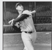
Ted Williams .344 AVG .482 OBP .634 SLG