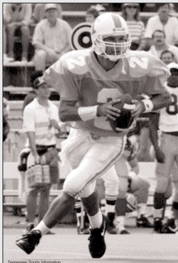
Tennessee Sports Information