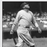
Babe Ruth .342 AVG .474 OBP .690 SLG